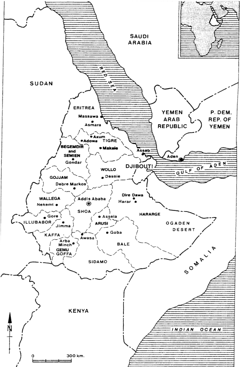
Map 1. Administrative Divisions of Ethiopia, 1974.