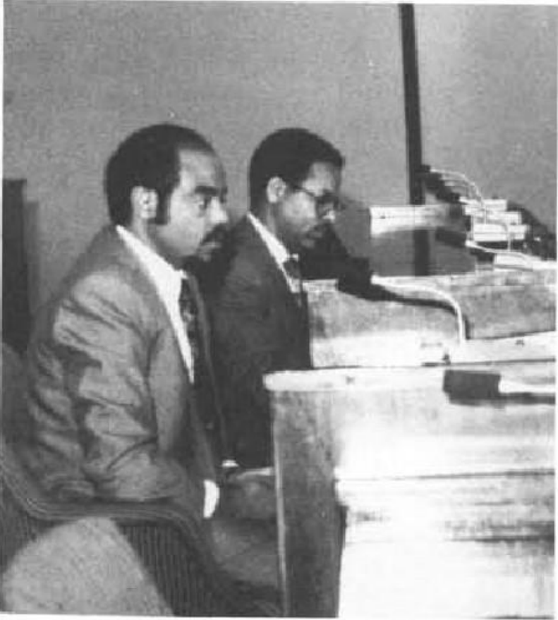
Meles Zenawi and Tesfaye Habisso of the EPRDF at the July 1991 National Conference.