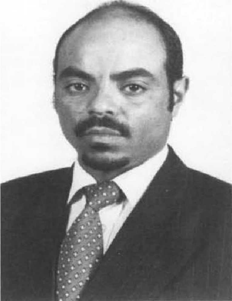
Meles Zenawi, President Of the Transitional Government of Ethiopia, Prime Minister of the FDRE.