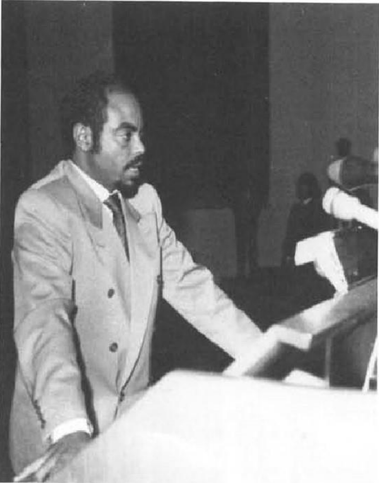
EPRDF leader Meles Zenawi at the July 1991 "All Party Conference" in Addis Ababa.