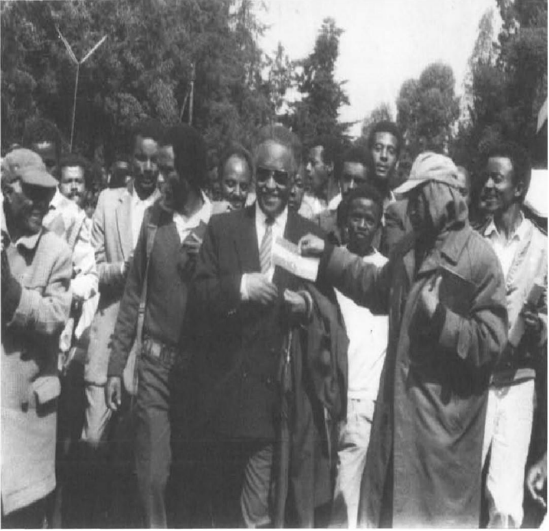
Professor Asrat Woldeyes. President of the AAPO, returning from a court appearance in Addis Ababa. June 1993