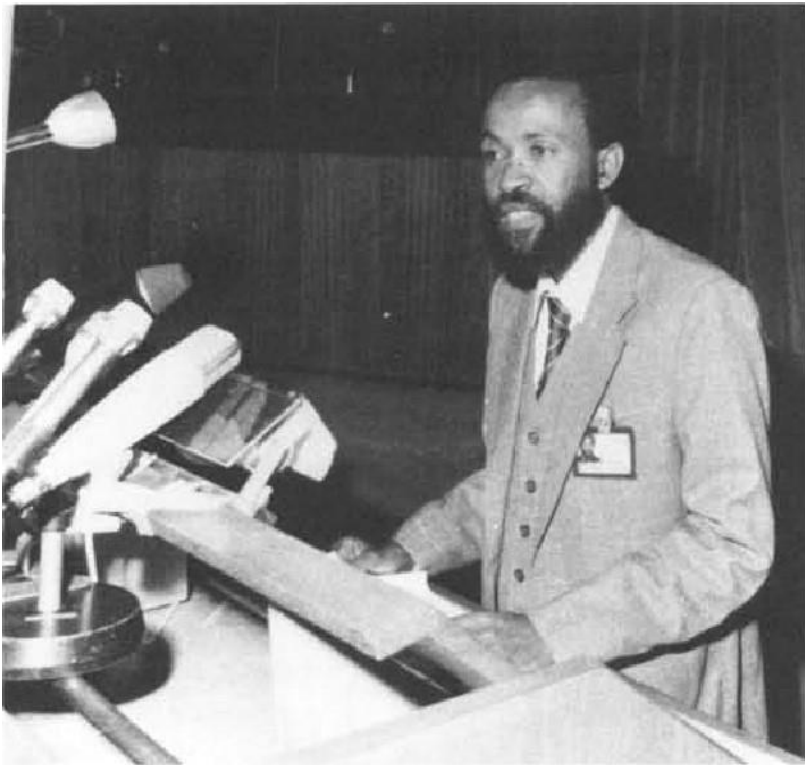
OLF leader Gelassa Dilbo at the July 1991 Conference.