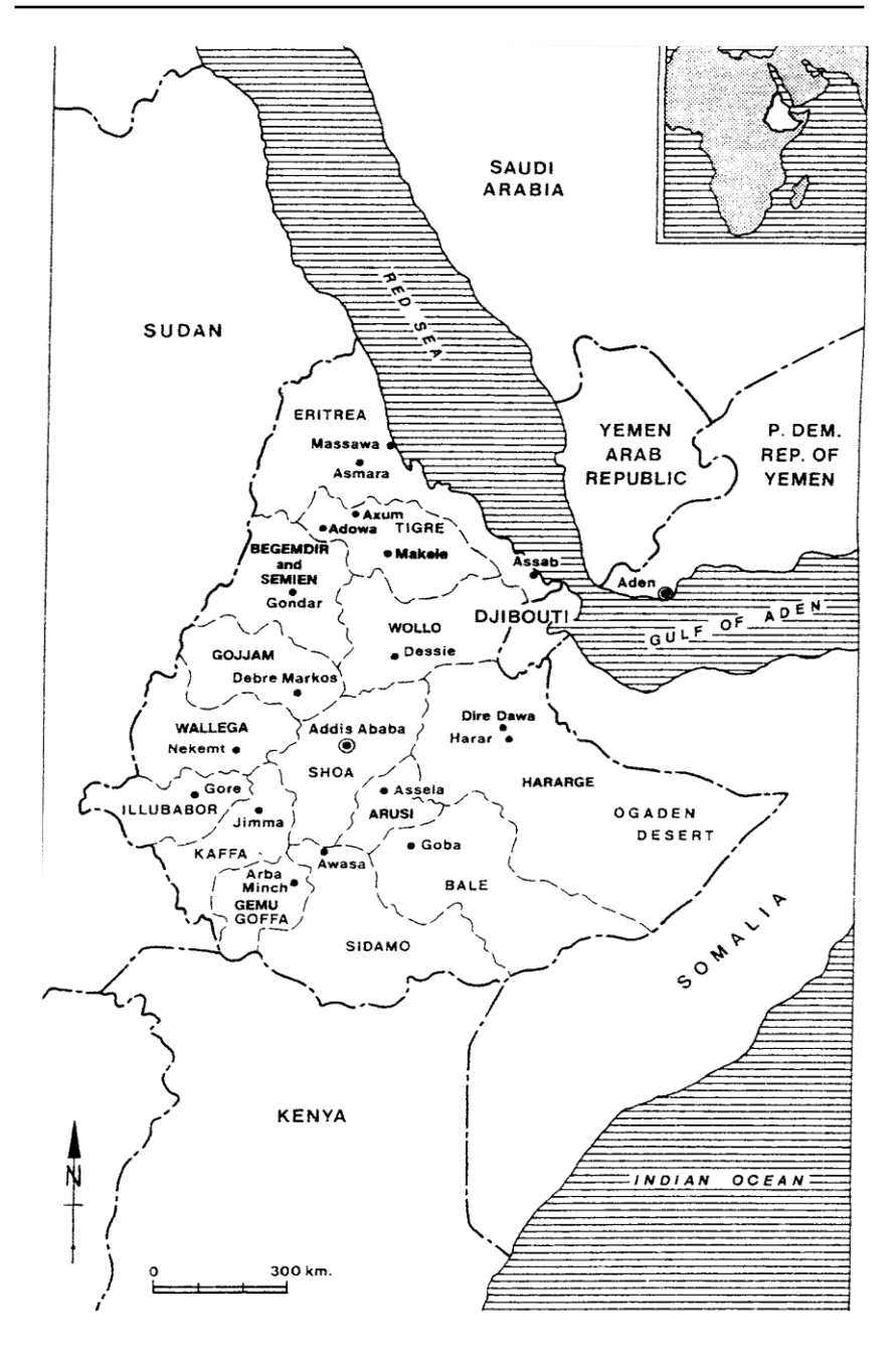
Map 1. Administrative Divisions of Ethiopia, 1974.