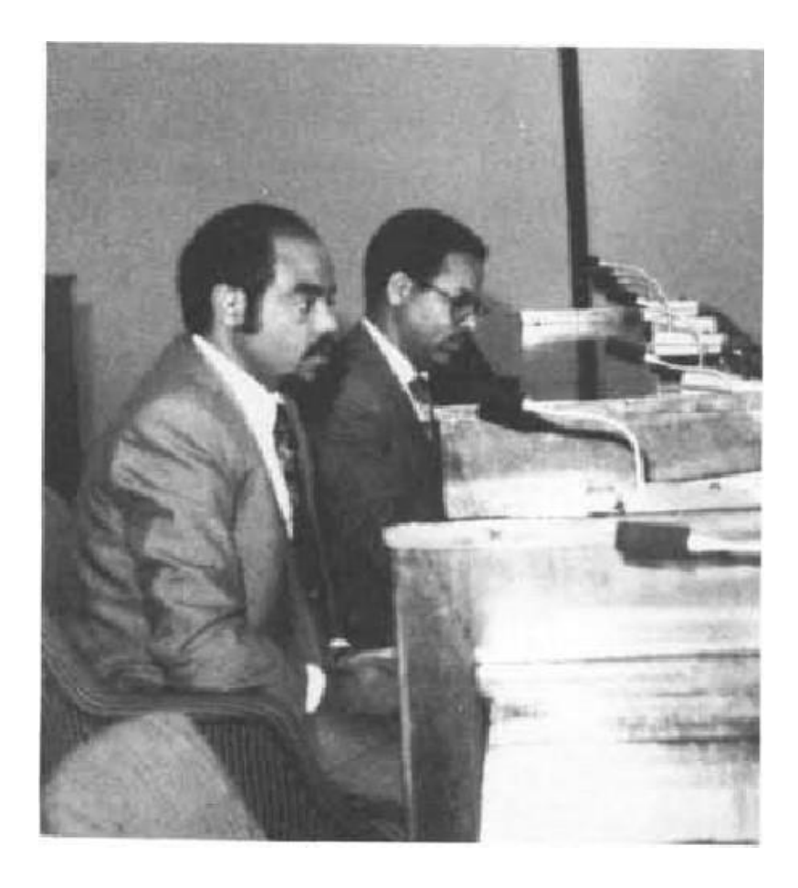
Meles Zenawi and Tesfaye Habisso of the EPRDF at the July 1991 National Conference.