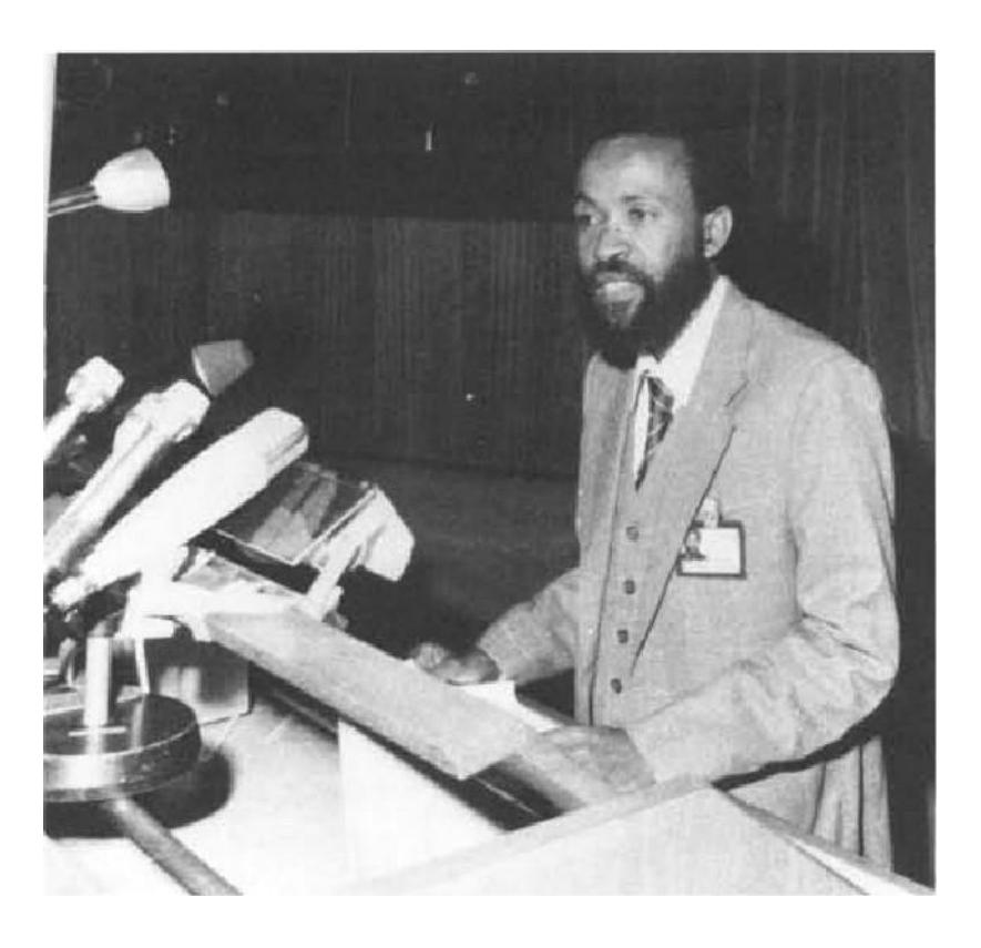
OLF leader Gelassa Dilbo at the July 1991 Conference.