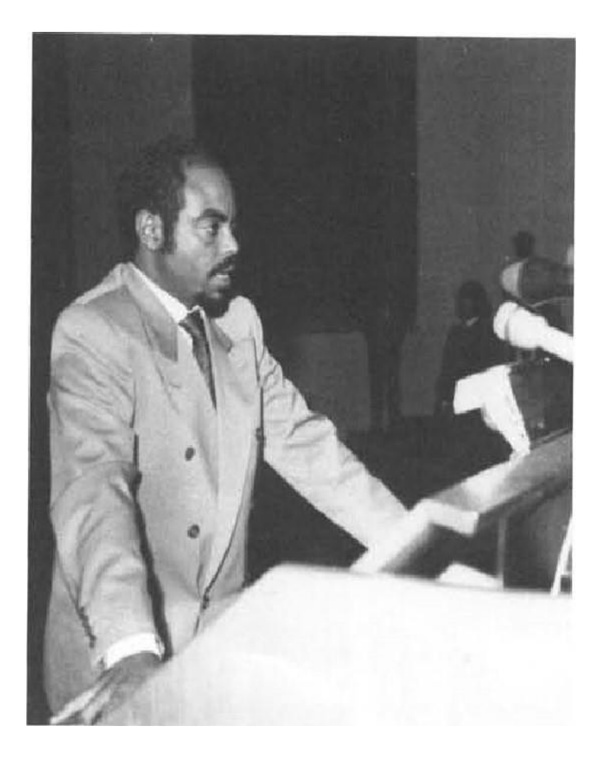
EPRDF leader Meles Zenawi at the July 1991 "All Party Conference" in Addis Ababa.