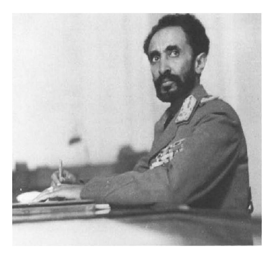
Haile Selassie, Emperor of Ethiopia. 1930—1974.